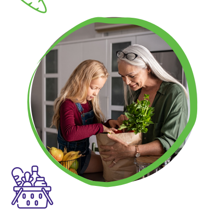
Sort and put away groceries.